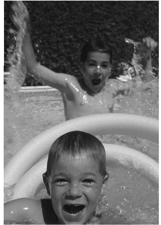
THE MALLARD LAKE POOL OPENS SATURDAY, MAY 28 AT 10:00 AM (Weather Permitting)